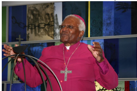
Archbishop Desmond Tutu on his visit to Oslo in 2008.

'The Rainbow people' was Archbishop Tutu's dream for South Africa. A rainbow is only visible