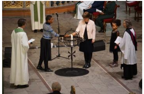
Candle lighting at the memorial service for Archbishop Desmond Tutu

Mary, Joseph, Jesus, yes God, are always involved in political events. The Holy God loves all humans and creates us in his/her image. For this reason, the dignity of all persons is holy. And, precisely for this reason, the church must care about politics, about oppression, freedom, and protection of the dignity of humans. If not, Tutu said, we neither care about God nor about people.