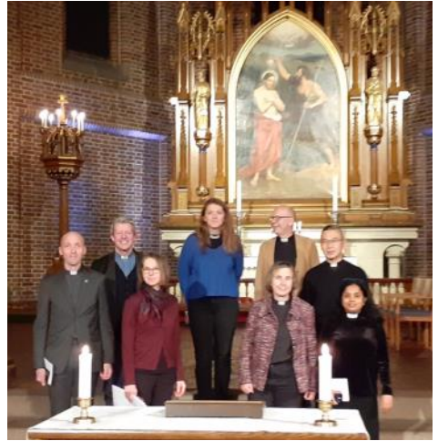
Global Week Service on Modern Slavery at Trefoldighetskirken.