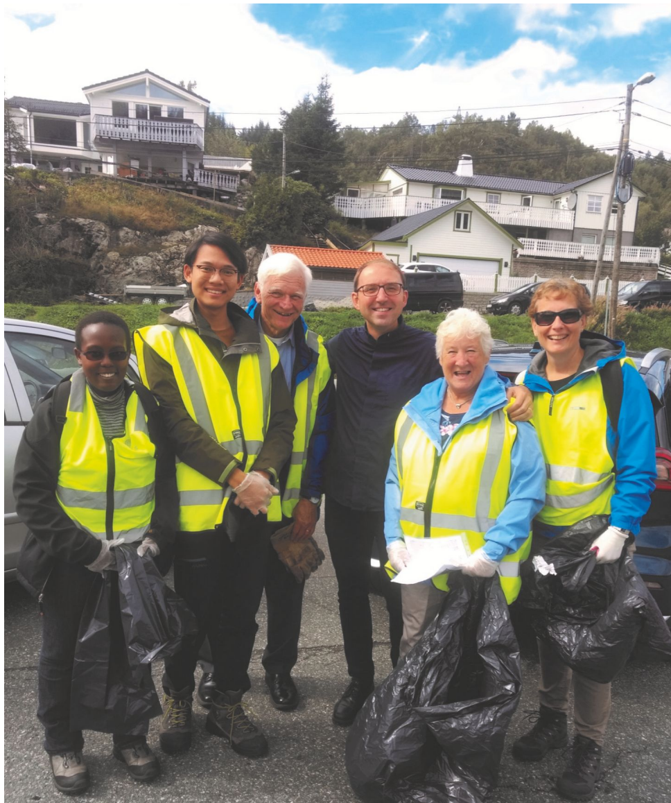
Bergen congregation members all ready to start on the fourth of six Sundays picking up litter for the City of Bergen